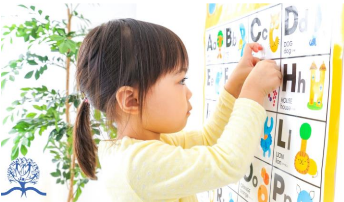
Curriculum and Development