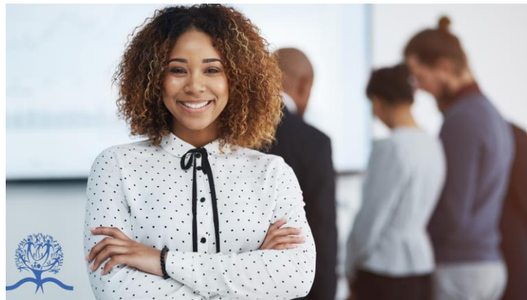
Leaders and Managers