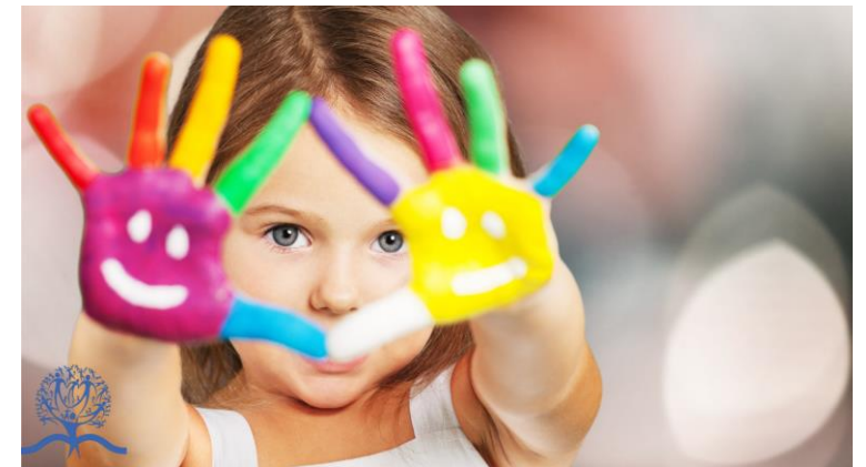
Inclusion and SEND